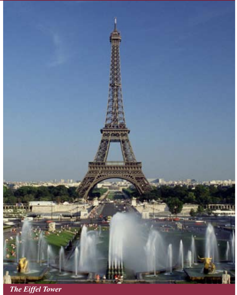
The Eiffel Tower