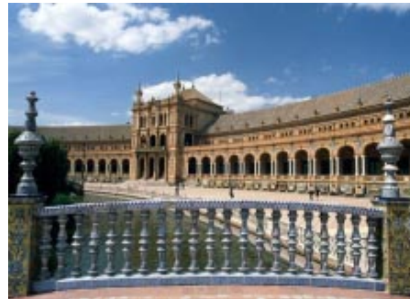
Plaza de España in Seville