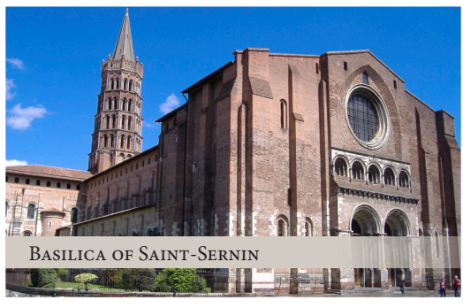
BASILICA OF SAINT-SERNIN

SATURDAY, MARCH 10 TH - Morning drive up into the Pyrenees Mountains. At La Mongie we board the cable car for the breath-taking ascent up to the Pic du Midi Observatory. We'll visit the museum at the summit with an exhibition about the building of the observatory complex and admire the incredible views before descending and continuing on our journey to Toulouse. After checking in to our hotel, we'll have a brief walking tour of Toulouse center, including a visit