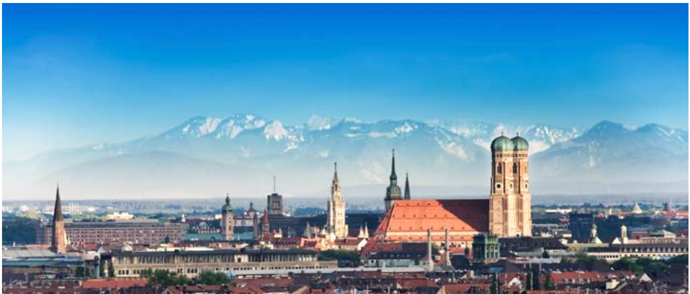
Munich - in the shadow of the Bavarian Alps

Key to included meals: B = Breakfast, L = Lunch, D = Dinner