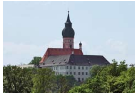
The Abbey of Andechs

(the Old Picture Gallery), with its wonderful collection of paintings gathered by the Wittelsbach family (the Dukes, and later kings, of Bavaria) from the 16th century onwards. The Deutsches Museum is one of the finest devoted to science and technical subjects in the world. Or, just outside the city, there is the Nymphenburg Palace, modeled on the Palace of Versailles, just outside Paris. (B)