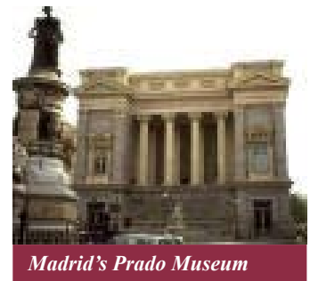
Madrid's Prado Museum