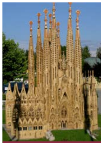
Gaudi's Sagrada Familia