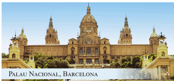
PALAU NACIONAL, BARCELONA