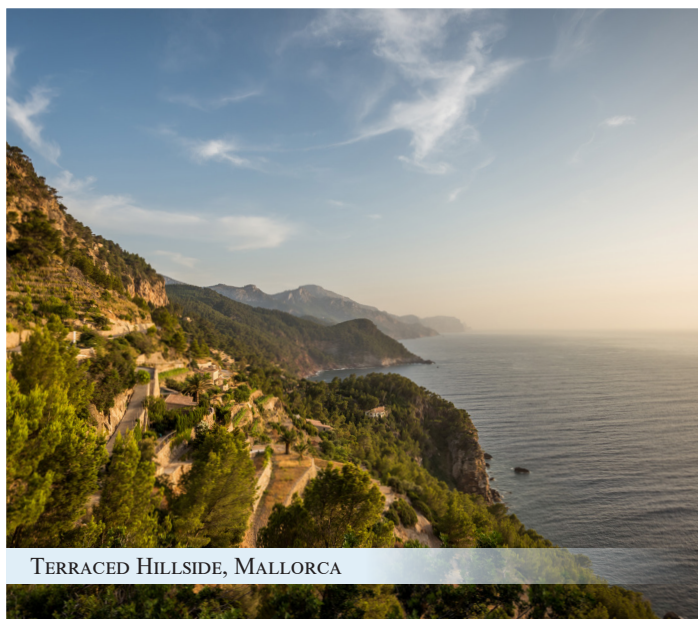
TERRACED HILLSIDE, MALLORCA