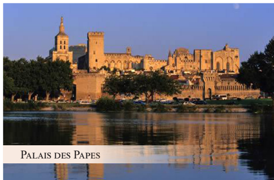
PALAIS DES PAPES

THE COST OF THIS ITINERARY, PER PERSON, DOUBLE OCCUPANCY IS: