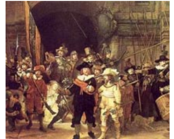
Rembrandt - The Night Watch