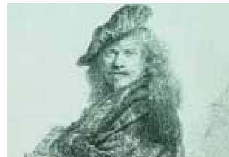
Rembrandt - Self Portrait