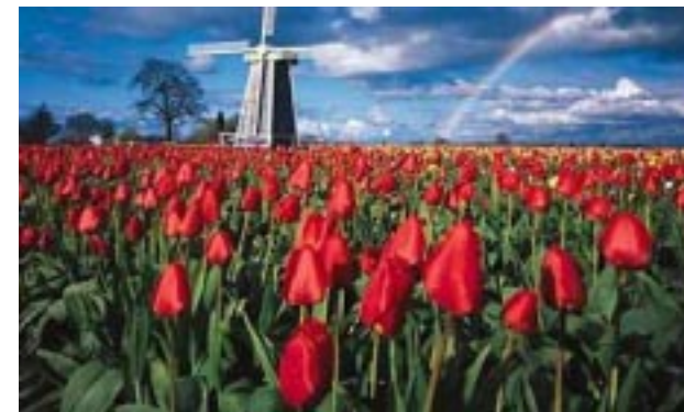
The bulb fields around Keukenhof

located in the heart of the bulbfields of Holland, which will be in full bloom at this time of year. We will return to Amsterdam for a final farewell dinner at our hotel. (B, D)