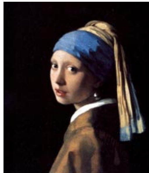
Vermeer - Girl With a Pearl Earring