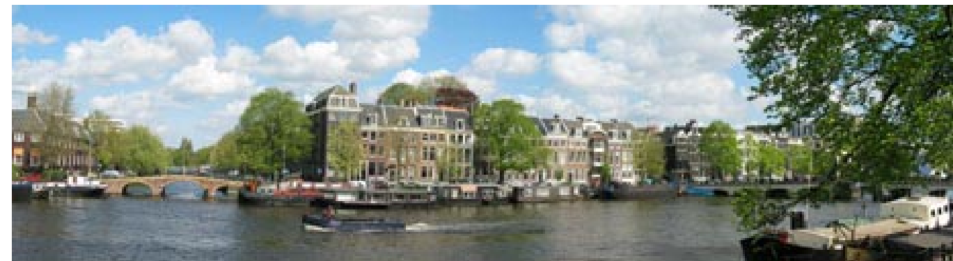
Life in Amsterdam revolves around the canals