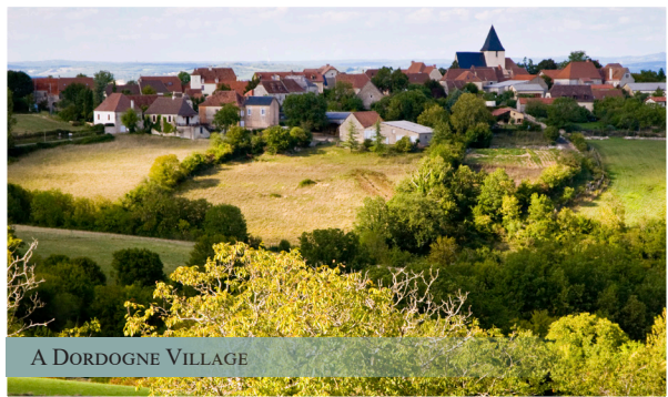
A DORDOGNE VILLAGE

FRIDAY, MAY 12 TH - Heading west today we leave Sarlat behind and follow the course of the Dordogne river towards Bordeaux. We stop in Bergerac for morning coffee and to explore the medieval center of this bustling river town. Continuing west we stop to visit the Jardins de Sardy in Velines. This garden merges a fantastic formal pond, very much in an Italian style, with cylindrical cypress trees dotted around. Our final stop for the day will be in St Emilion where we’ll enjoy a wine tasting before retiring to our final hotel for a farewell dinner. (B, D) OVERNIGHT: ST. EMILION