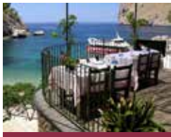
Join us for lunch?

Wednesday, May 6th. Leaving our hotel this morning we head to the capital of the island, Palma, a city of some 300,000 inhabitants. On arrival we'll head into the historic center of the city for a walking tour that includes a visit to the fabulous gothic cathedral, known as "La Seu," with a spectacular altar piece by Gaudi. Then we'll take a flight to Barcelona to join up with the other arriving group members for their afternoon and evening activities. (B, D) Overnight: Barcelona