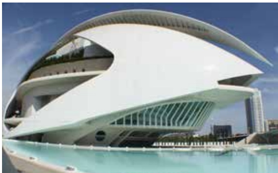
Valencia - the Opera House

Tuesday, May 12th. Today, we take an excursion to the ancient city of Cuenca. Heading inland, we will pass through mountainous, craggy countryside, as dramatic as any in Spain, arriving mid-morning at this extraordinary city perched high on a bluff and enclosed on three sides by the Huecar and Jucar rivers. A walking tour with a local guide will take us through the Cathedral and the fabulous Museo de Cuenca. There will be free time for lunch and a chance to wander through the narrow maze of lanes, which peter out in breathtaking views to the west and east. We return to Valencia for an evening of paella and flamenco. (B, D) Overnight: Valencia