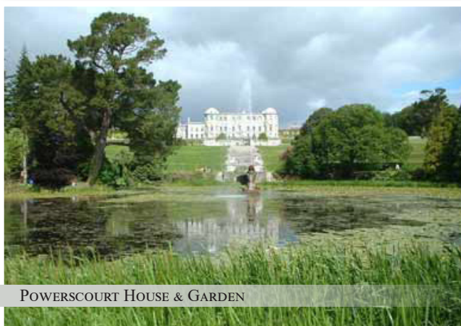
POWERSCOURT HOUSE & GARDEN

Please note that travel insurance is not included on this tour. Insurance information will be mailed to each registration on receipt of deposit.