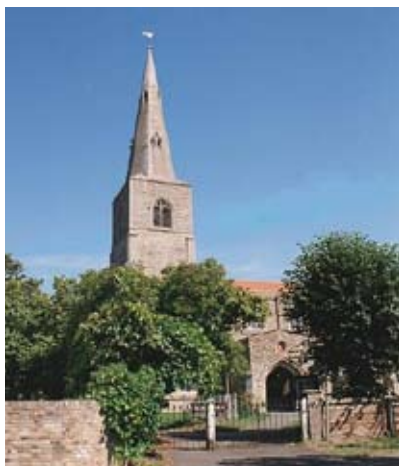
St Peter & St Paul, Fenstanton

Thursday, May 12 th . A morning walking tour introduces this fascinating but compact city. We'll start with a tour of magnificent York Minster, visit the Treasurer's House, with its basement haunted by the Roman 9 th Legion, walk down the Shambles, one of England's finest medieval streets, and stroll along the medieval city walls. For lunch, you might want to try the nationally renowned tearoom of Betty's to sample Yorkshire specialties. The afternoon is free for independent explorations: shopping, a boat ride, evensong in the Minster. This evening, you might want to join a Ghost Walk, which takes you through York's narrow alleys and "snickleways." Centuries of history and ghosts come together in a spine-tingling adventure. (B) Overnight: York