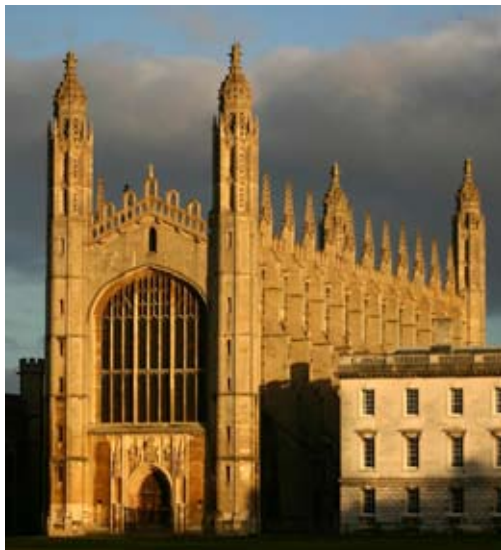
King's College Chapel, Cambridge

The cost of this itinerary, per person, double occupancy is: