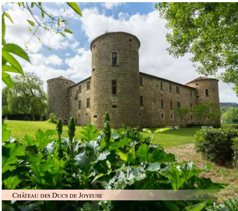
CHÂTEAU DES DUCS DE JOYEUSE

With Château des Ducs de Joyeuse as our base for four nights, we will be immersed in the history of the region and, each day, we will set off to explore the antiquities of the Aude and Ariège. From the ruins of Cathar castles to the medieval grandeur of Carcassonne, it will be impossible to head home without feeling touched by the shadows of the past!