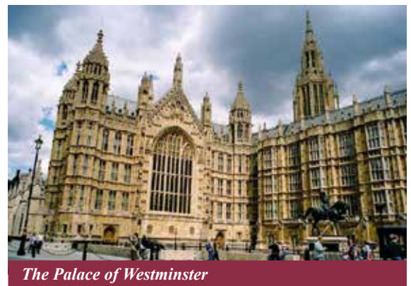
The Palace of Westminster