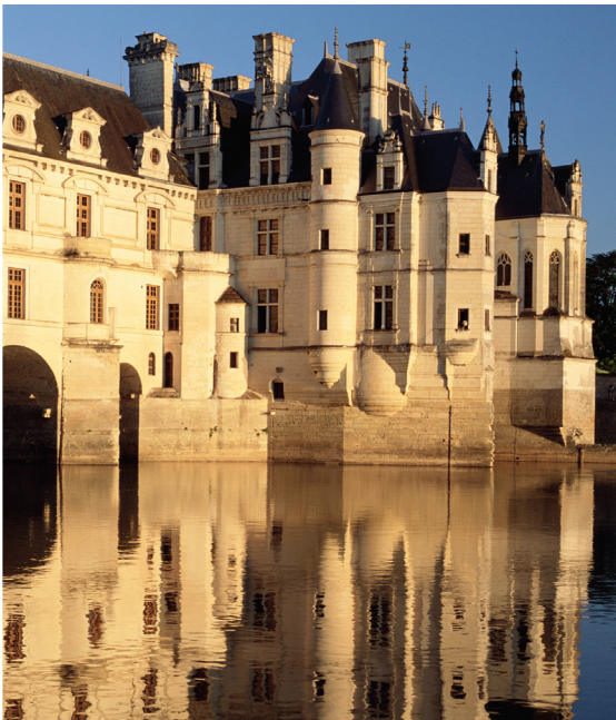
THE CHÂTEAU DE CHENONCEAU

Continuing on to the Loire Valley, we'll sample a selection of stunning medieval and Renaissance chateaux, scattered around the countryside. From the romance of Chenonceau arching across the Cher River, to the staggering grandeur of Chambord, a Renaissance masterpiece, and all of their many intricate gardens, here is an experience of magnificence that reveals itself day by day.