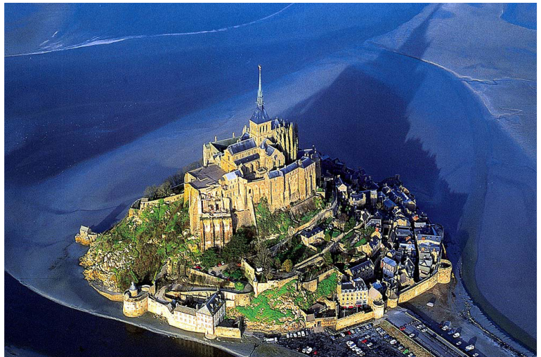
MONT ST. MICHEL

This spring, when the "Garden of France" is in full bloom join Discover Europe on a truly memorable adventure in northwest France.