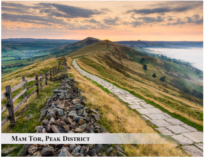
MAM TOR, PEAK DISTRICT