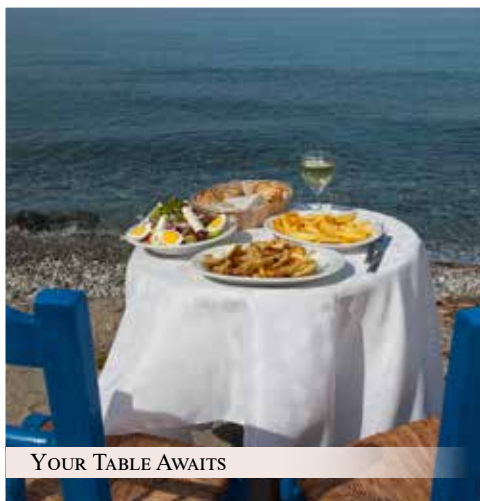
YOUR TABLE AWAITS

WEDNESDAY, JUNE 9 TH - This morning we take a short taxi ride to the port and board the fast ferry from Heraklion direct to Santorini - a crossing of just under 2 hours. After time to check in and have lunch we will gather for an afternoon visit to Akrotiri, one of the most important prehistoric sites in the world, showing evidence of settlement from as early as the 4th millennium BCE. Like Pompeii, much of the site was preserved as a result of a volcanic eruption covering it in a layer of ash - however, the eruption at Akrotiri occurred 1,650 years earlier! Dinner is included this evening (B, D) OVERNIGHT: SANTORINI