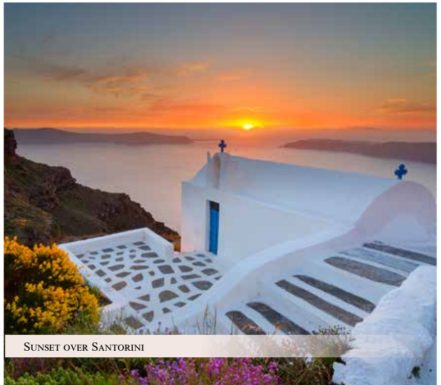
SUNSET OVER SANTORINI

THE COST OF THIS ITINERARY, PER PERSON, DOUBLE OCCUPANCY IS: