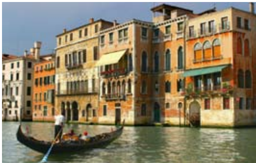
Venice - The Grand Canal

Friday, June 27. We'll begin our half-day guided tour with a visit to the Doge's Palace in glorious Piazza San Marco, "the most elegant living room in Europe," according to Napoleon. The Palazzo, a miracle of Gothic engineering, typifies a constant feature of Venetian architecture—the predominance of open space and a peculiar quality of lightness, that is in turn echoed by the surrounding water. In the afternoon you are free to wander the streets, or take a vaporetto to one of the nearby islands—Murano (glass), Burano (lace), or San Michele (the cemetery island). If you're curious about gondolas, float back to the hotel after your explorations. (B) Overnight: Venice