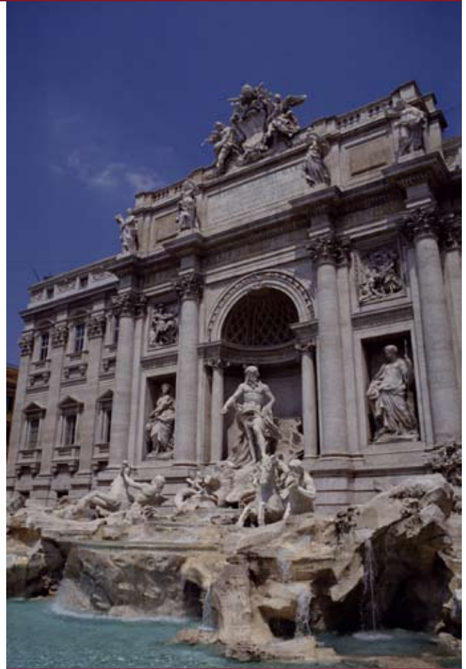
Rome - The Trevi Fountain

Finally, as we wend our way toward Venice, we'll stop in Padua and Bologna, rich in medieval history and art. Our pilgrimage ends in Venice, a dazzling city that marries light, water, open space, and Gothic grandeur in a breathtaking amalgam—a fitting way to culminate our visit to Italy's priceless treasures.