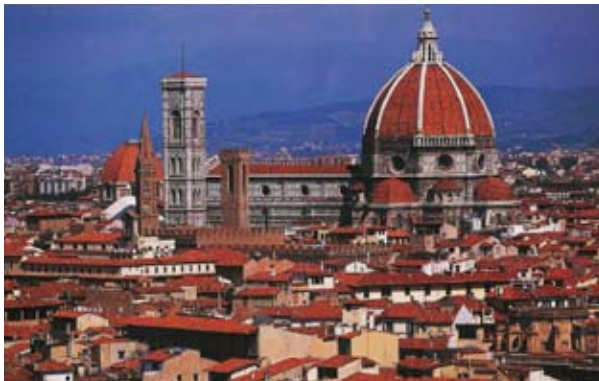
Florence - The Duomo

The cost of this itinerary, per person, double occupancy is: