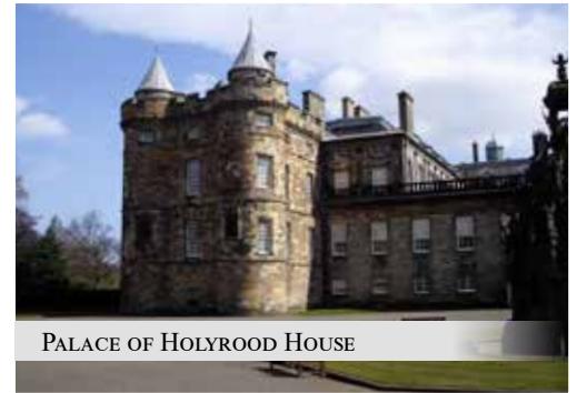
PALACE OF HOLYROOD HOUSE

MONDAY, JUNE 28 TH - A morning excursion takes us to Culloden, the site of the battle in 1745 where Scottish hopes of independence were dashed by the “butcher” Cumberland and his Hanoverian infantry. We’ll return to Inverness for a free afternoon and evening in the city. (B) OVERNIGHT: INVERNESS