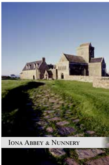
IONA ABBEY & NUNNERY

THURSDAY, JULY 1 ST - Today we take the ferry back to the mainland and follow the coast south. Skirting around Fort William, we stop in the breathtakingly beautiful and haunting valley of Glen Coe, literally the “Valley of Weeping.” It was here that the MacDonalds were betrayed and brutally murdered by Campbell of Glenlyon in 1692. The Visitor Centre’s short film recounts the events leading up to that fateful day. A short drive brings us to the ferry where we cross over to the Isle of Mull and the town of Tobermory where we have dinner and spend the night. (B, D) OVERNIGHT: MULL