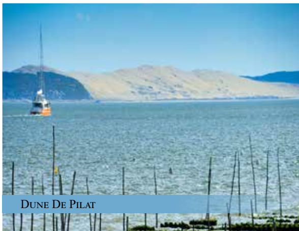
DUNE DE PILAT

THURSDAY, JULY 1 ST - An excursion to the south today takes us to visit the romantic ruins of the Abbey of Sauve-Majeure. Originally founded in 1079, this Benedictine monastery became an important stopping point on the pilgrimage route to Santiago de Compostela. It is now a UNESCO World Heritage Site, mainly because of the wonderful examples of Romanesque architecture that still survive here. On our return to Bordeaux, the afternoon is free until we gather again for dinner at a local restaurant this evening. (B, D) OVERNIGHT: BORDEAUX