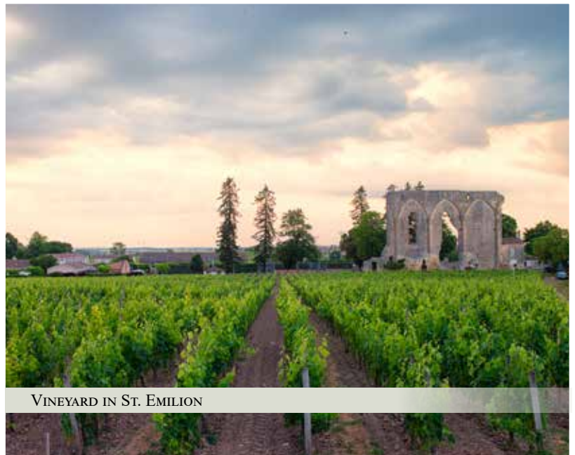
VINEYARD IN ST. EMILION

Bordeaux; the name itself conjures up a myriad of complex wine expectations. As France's largest wine producing region, and home to famous appellations, the region of Bordeaux has much to offer both the wine connoisseur and the novice alike. The city of Bordeaux, once nicknamed La Belle Endormie (the Sleeping Beauty) used to be plagued with industrial soot and despair, leaving wine lovers wanting to sample the local produce from far away! But like the grapes in the bottles, age has worked in her favor. Over the past decades, the city of Bordeaux has reinvented herself, now mirroring the beauty of the sprawling vineyards that surround her.