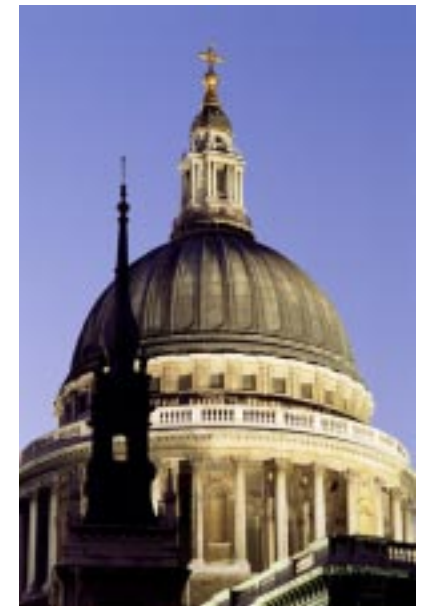
The Dome of St. Pauls

Key to included meals: B = Breakfast, L = Lunch, D = Dinner