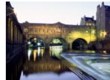
Bath - the Pulteney St. Bridge

St. Charles UCC will be accompanied throughout the tour by Discover Europe's own courier who holds a special interest in the history of Non-Conformism and a passion for all that is England. This June, as the summer sun begins to warm the meadows and fields of England, join St. Charles and Discover Europe on the pilgrimage of a lifetime.