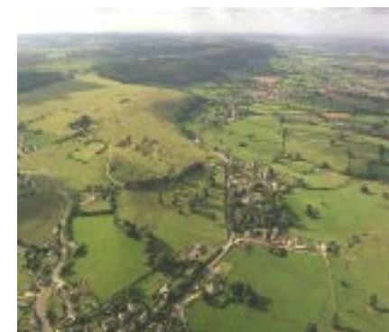
The Cotswold Hills

Thursday, July 8 th The day begins with a sightseeing tour of London. We'll start in the City of Westminster with a visit to Westminster Abbey and then drive by many of London's major monuments. Heading east into the City of London, we'll lunch at the historic Mayflower Pub before we take a guided tour of St. Paul's Cathedral. The rest of the afternoon and evening are free to make your own plans; spend an evening at the theatre or perhaps try one of London's great restaurants or a quiet pint in the neighborhood pub. (B, pub L) Overnight: London