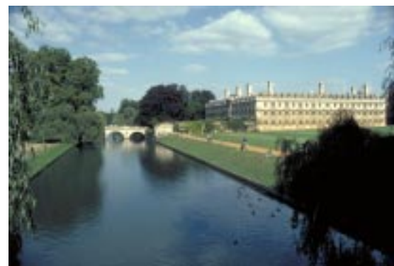
Cambridge - The "Backs"

Saturday, July 3 rd Leaving Lincoln we head north across the magnificent Humber suspension bridge to the city of York. After time for lunch, a walking tour introduces this beautifully maintained medieval city. We'll visit York Minster, Britain's largest Gothic building containing the finest medieval stained-glass windows in the country, and have free time to visit the Jorvik Viking Centre, a reconstruction of the original Viking settlement, or the National Railway Museum before we drive the short distance to Bradford and meet with our host families. (B) Overnight: Bradford