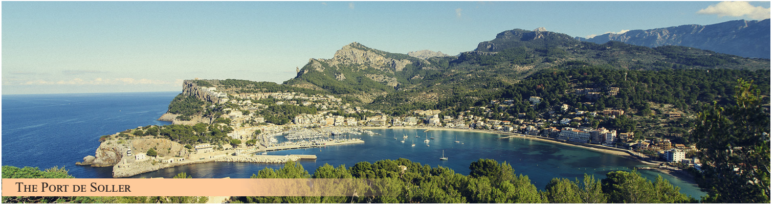
THE PORT DE SOLLER