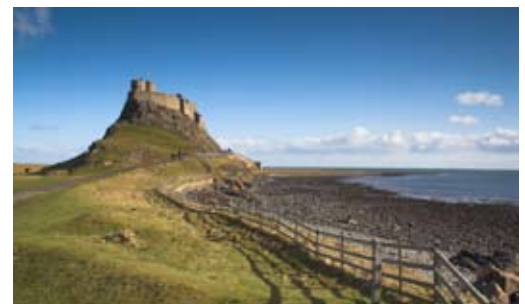
Lindisfarne, the Holy Island

Saturday, July 25. Morning transfers take you to the airport in Edinburgh for returning flights to the U.S. (B)