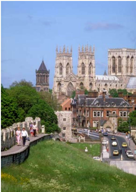
The City of York