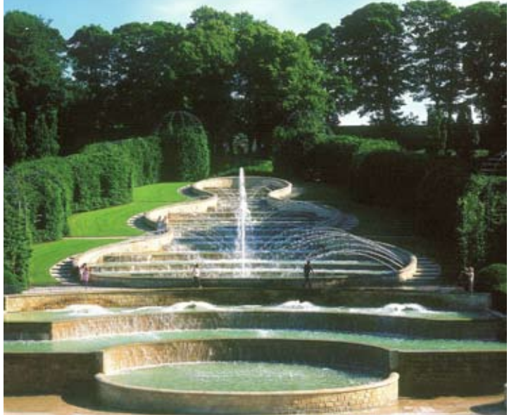
Alnwick - the Grand Cascade

Here, deep in England's north country, you'll enjoy a full range of inspiring, relaxing, and eye-opening excursions that take you from the towers of York Minster to the gorgeous monastic ruins at Fountains Abbey to the elegant city of Edinburgh. Together we'll explore the exquisite gardens at Studley Royal, enjoy a private tour of Newby Hall, and visit award-winning Durham (Britain in Bloom award), lovely Lindisfarne, off the northeast coast of England, and beautiful Berwick upon Tweed, caught in the historic dispute between Scotland and England.