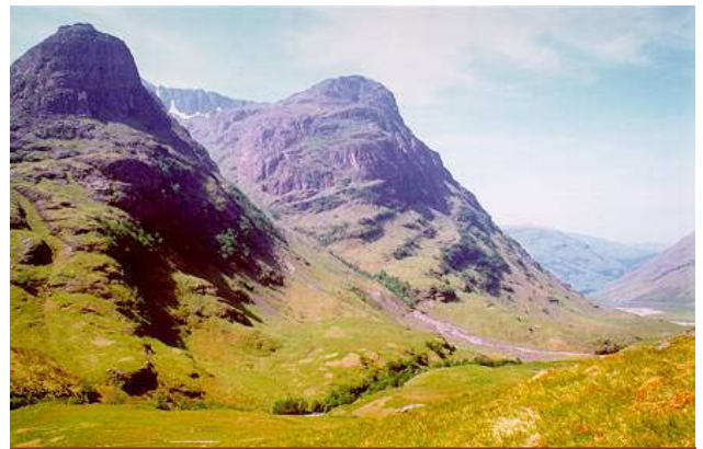
Glen Coe, the Valley of Weeping

Saturday, August 25. A return today to the bright lights of Glasgow. We'll skirt Fort William and stop in the breathtakingly beautiful and haunting valley of Glen Coe, literally the "Valley of Weeping." It was here that the MacDonalads were betrayed by Campbell of Glenlyon in 1692. The short film at the Visitor Centre recounts the events leading up to that fateful day. We'll then cross Rannoch Moor and travel along the banks of Loch Lomond to our hotel. Our closing dinner party this evening brings us together for a final opportunity to share stories and laughter. (B, D) Overnight: Glasgow