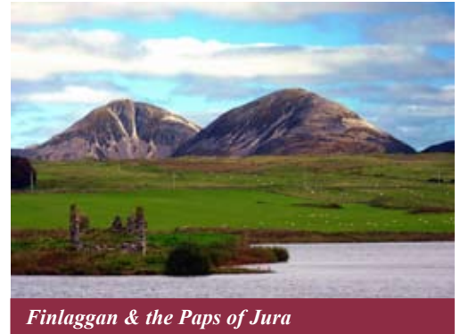
Finlaggan & the Paps of Jura

Sunday, August 19. A panorama of Islay today. You'll discover the proud history of the island as we travel to various points of interest including the round church at Bowmore and Kildalton Chapel with its fine 8 th -century Celtic cross. We'll visit the Royal Society for the Protection of Birds Centre, the Port Charlotte Museum, and, if open, the Ardbeg Distillery. Dinner together this evening in a local pub. (B, D) Overnight: Isle of Islay