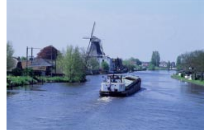
Holland - canals and windmills

The Rhine has been described as one of the “axes of civilization” and provides the unifying link that flows through this custom designed itinerary. Its 820 miles flows through 4 different European countries and, in many cases, provides the boundary between them. For many centuries it marked the northern boundary of the Roman Empire.