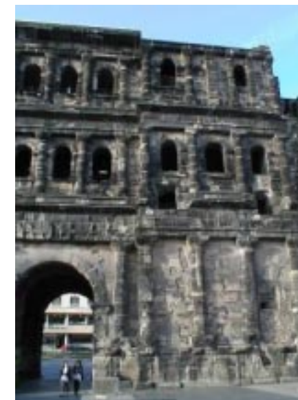
The Porta Negra, Trier