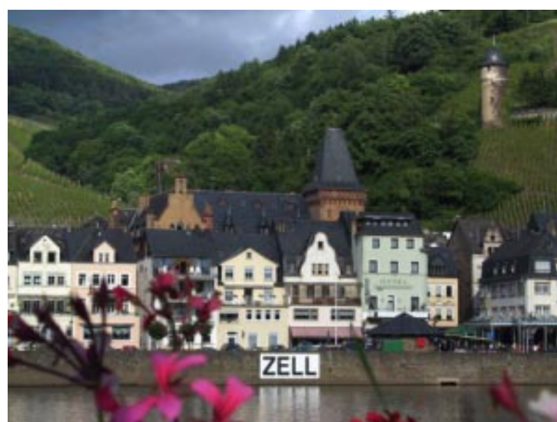
Zell, on the Mosel River

Tuesday, September 6 th Overnight: Bruges This morning we explore the city of Bruges, a medieval jewel and one of the European cities selected as a 2002 "cultural capital." We'll tour the city by canal boat and then visit the Gruuthuse Museum, recently renovated with a fine collection of tapestry, furniture, silver, ceramics, lace-making tools and even a guillotine! Free time this afternoon to browse at leisure, perhaps visit the open-air market to pick up a bargain or two. (B)