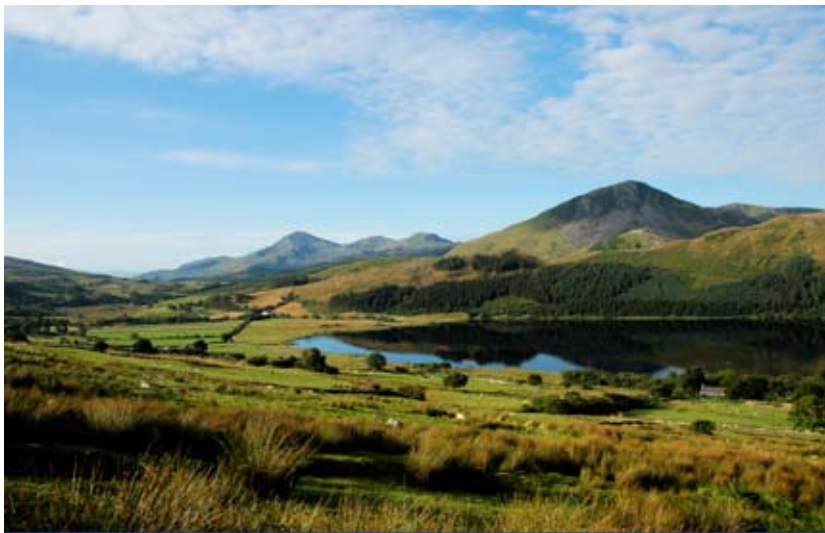
Snowdonia National Park