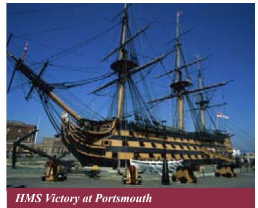
HMS Victory at Portsmouth

Our day in Portsmouth will begin with a visit to the Charles Dickens Birthplace Museum, the house where the great novelist was born in 1812, and lived for a short while thereafter. From here we will visit the Portsmouth City Museum with its excellent collection highlighting the life of Arthur Conan Doyle in the city. We'll take a break for lunch and then spend the afternoon at the Historic dockyard with visits to the HMS Victory and the new Mary Rose (Henry VIII's ill-fated flagship) exhibition. The evening is free to sample a local restaurant. (B)