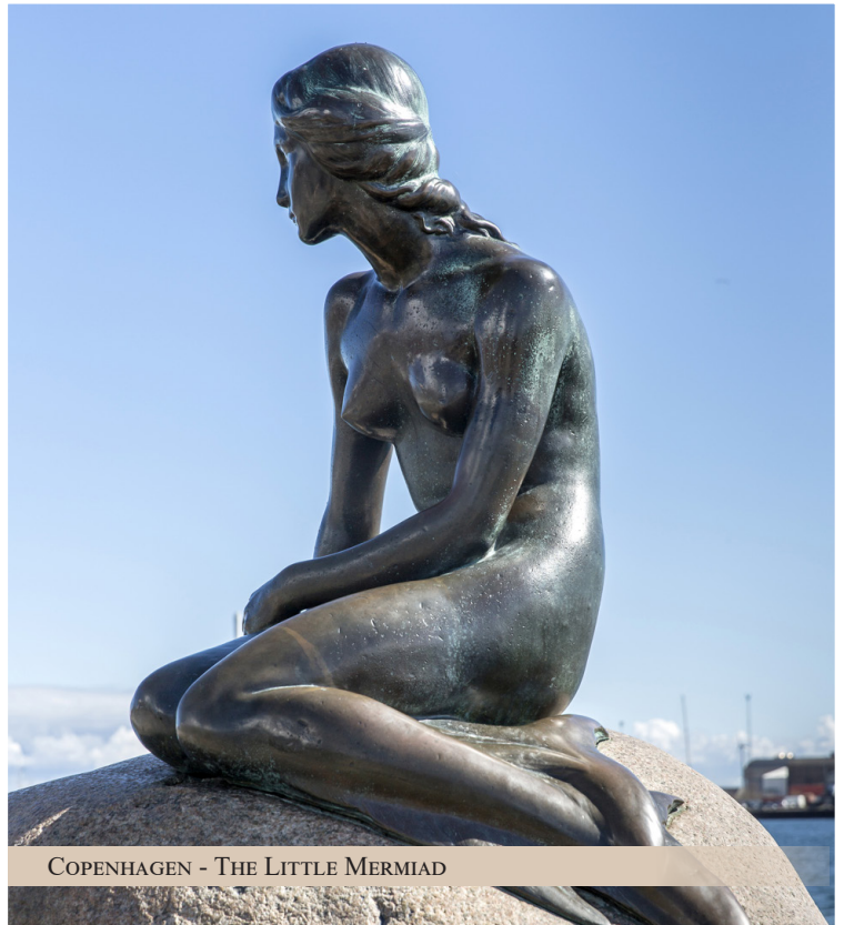
COPENHAGEN - THE LITTLE MERMIAD

It is with great pleasure that we invite you to Scandinavia to savor its art, architecture, culture, food, scenery, and hospitality this coming September.