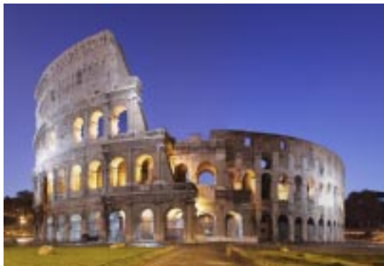
The Colosseum at Night

The cost of this itinerary, per person, double occupancy is: