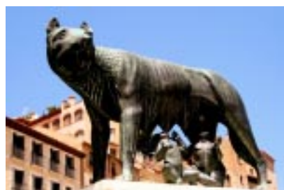
The Capitoline Wolf