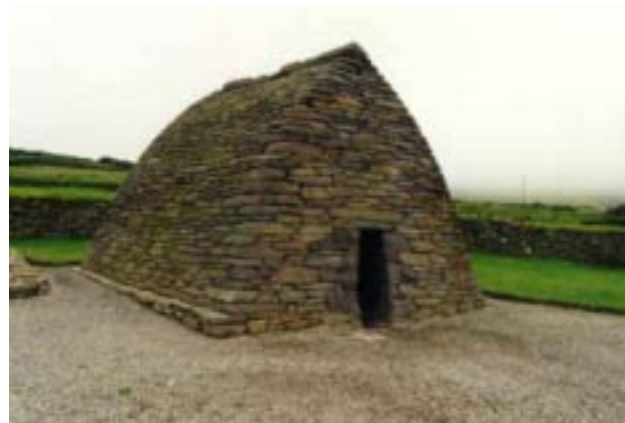
The Oratory of Gallarus

Leaving Dublin, we head southwest, making our first stop at the Irish National Stud in Kildare, Ireland's premier horse breeding facility, and arriving at Cashel in the late morning. The Rock of Cashel is like the Acropolis of Athens, dominating the surrounding countryside and supporting important religious structures: the cathedral, a round tower, and Cormac's Chapel, the supreme masterpiece of Irish Romanesque art. After lunch we continue our journey westwards to Lough Gur. We visit the Lough Gur Stone Age Centre and view the greatest stone circle in Ireland and other pre-Christian monuments that dot the banks of the lake. We conclude our day's travels at the Dunloe Castle Hotel just outside Killarney. Overnight: Dunloe Castle (B, L, D)