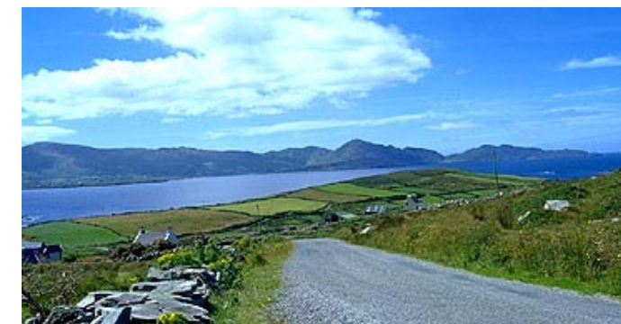
The Connemara Coast

Spend the day in Yeats' country. Driving inland through Castlebar and Tobercurry to Sligo, we first visit the Carrowmore Passage Grave Cemetery in the shadow of Knocknarea, crowned by the unexcavated tomb of Queen Maeve. We then enter the town of Sligo to see several works by Jack Yeats, brother of the poet, in the County Art Gallery. After free time for lunch we'll take a detour around Lough (lake) Gill to see the "Lake Isle of Innisfree." We will stop in Drumcliff to see the grave of W.B. Yeats and the high cross nearby, then follow the coast around the base of Benbulbin to visit the Creevykeel Court cairn, one of the finest in Ireland. At Beleek we cross briefly into the Six Counties and drive along the north side of Lower Lough Erne across Boa Island, where we visit the Caldragh cemetery with its wonderful pre-Christian Janus figures. We continue north into County Donegal arriving at our hotel in Ballybofey in time for dinner. Overnight: Jackson's Hotel (B, D)