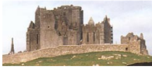
The Rock of Cashel