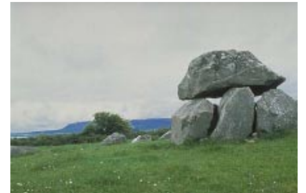
Carrowmore Passage Grave