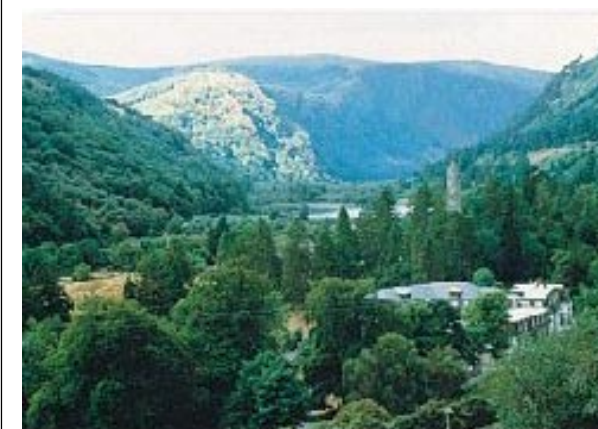
The Valley of The Two Lakes - Glendalough

Drive inland through County Donegal into Yeats country, pausing in Sligo and Drumcliff to see the grave of W.B. Yeats. Traverse the Blue Stack Mountains and descend to coastal Ardara, a center for the Donegal homespun and knitting industry. Travel along the spectacular coast of Donegal Bay where the mountains plunge to the sea creating a beautifully indented coastline. Stop in villages rich in prehistoric and early Christian remains, and visit Malin Head, situated on the remote Inishowen Peninsula.