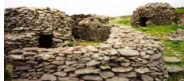
"Beehive" huts on the Dingle Peninsula

Our full day excursion around the Dingle Peninsula begins at Inch and includes visits to the beehive huts at Fahan and Dunbeg Fort en route to Sleah Head with magnificent views of the Blaskets Islands. We visit the Blasket Centre in Dunquin and continue around the increasingly wild farther reaches of the peninsula, stopping for lunch in Ballyferriter. Amid the towering wild fuchsia hedges that line the narrow roads, we will find the early Christian Gallarus Oratory and the monastic site at Kilmalkedar with its Romanesque church, "alphabet stone," ogham stone, and sun dial, and the superbly carved Reask pillar stone. In the town of Dingle we visit the Presentation Convent to see the Harry Clarke stained glass windows and at Ballintaggart we see a collection of nine ogham stones in a circular burial ground. Crossing to the north coast of the peninsula via spectacular Connor Pass we skirt Tralee Bay to visit the largest working windmill in Europe at Blennerville. Then return to Beaufort for a look at another collection of ogham stones. This evening we'll have a festive farewell dinner complete with traditional Irish folk music and dancing at a local pub. Overnight: Dunloe Castle (B, L, D)