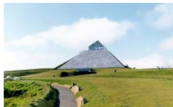
Céide Fields Visitor Centre

Driving north from Ennis this morning our first stop is at Thoor Ballylee, the restored tower house that was home to W.B. Yeats. We continue on to north of Loughrea to visit the phallic Turoe Stone, a masterpiece of Iron Age LaTène sculpture. Then head west into County Galway, toward the quartzite peaks of the Twelve Bens and Clifden, famous for Connemara tweeds. After a luncheon stop in Letterfrack, originally a Quaker settlement, we visit Kylemore Abbey, the extraordinary neo-Gothic structure built as a mansion in the nineteenth century, now a Benedictine convent. From here the road takes us around Killary Harbour and through the Delphi Pass down to Clew Bay at Louisburgh. We follow the coast past Croagh Patrick to our hotel in Westport where dinner awaits us. Overnight: The Westport Woods Hotel (B, L, D)