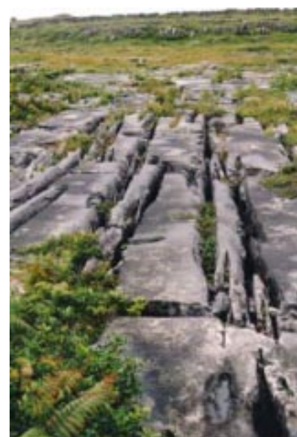
The Limestone Pavement of the Burren

Following breakfast and a slide-illustrated lecture presented by Professor North, depart for a full day exploration of North Clare. We'll stop first at the Dysert O'Dea Archeology Center and view the church and High Cross on the adjacent site. Then continue through Corrofin to Kilfenora, with its 12 th -century cathedral and high crosses. Visit the Cliffs of Moher and continue to the spa town of Lisdoonvarna for lunch. From here we explore "The Burren", including several megalithic sites. This is an area of strange limestone scenery that was described in frustration by one of Cromwell's generals as having "neither wood to hang a man, water to drown him nor earth to bury him in." Our final visit of the day will be to Corcomroe Abbey (St. Mary of the Fertile Rock), founded in 1194 and notable for carvings that reflect flowers of the Burren. We return to our hotel for dinner. Overnight: The Clare Inn (B, D)