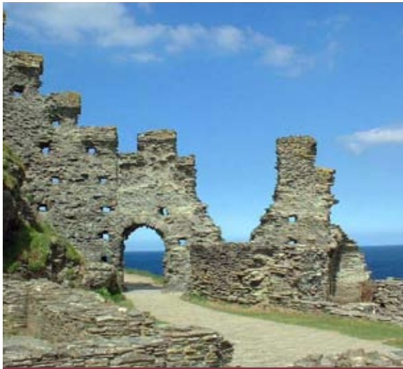
The Ruins of Tintagel Castle

The cost of this itinerary, per person, double occupancy is: