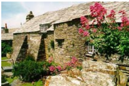
Tintagel's "old" post office

Wednesday, September 23. Leaving Penzance, we journey back in time to Tintagel Castle, legendary birthplace of King Arthur. Set on a wild and windswept headland, the ruins of this 13 th -century castle were preceded by an Iron Age castle and settlement. From here we strike deep into the West Country moors—Bodmin, steeped in Arthurian legend, and Dartmoor, one of the last true wildernesses in England. On to Exeter, where much remains of the city's Roman and medieval walls, for a visit to the stunning Exeter Cathedral, England's finest example of decorated Gothic architecture, with its magnificent nave and the longest Gothic vault in Europe. In the evening we dine in Taunton at the Castle Hotel, our home for the next two nights. (B, D) Overnight: Taunton