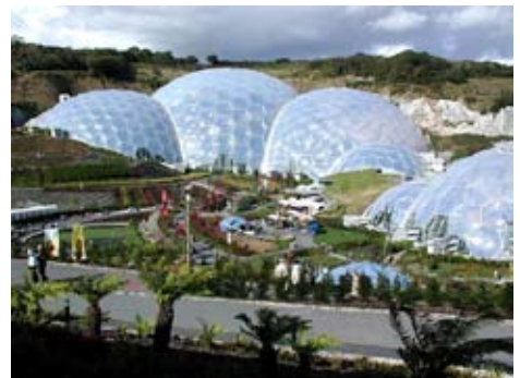
The Eden Project

Saturday, September 26. Airport transfers this morning to one of London's major airports for your return flight to the USA. (B)