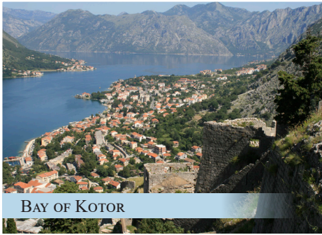
BAY OF KOTOR

MONDAY, SEPTEMBER 21 ST - A full day excursion to Montenegro. Nestled between the Adriatic's Gulf of Kotor and surrounding mountains, the medieval-walled old city of Kotor is a UNESCO World Heritage Site. Explore the narrow streets, cathedrals and historic squares that served as important commercial and artistic centers in the Middle Ages. Enjoy a free evening at a local restaurant. (B) OVERNIGHT: DUBROVNIK