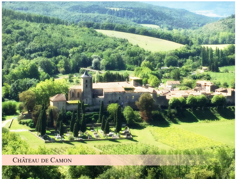
CHÂTEAU DE CAMON