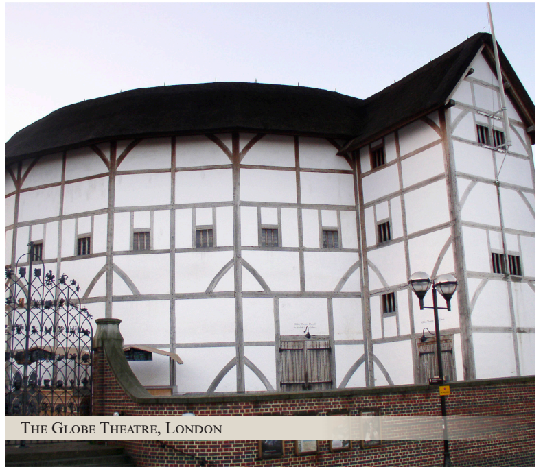
THE GLOBE THEATRE, LONDON