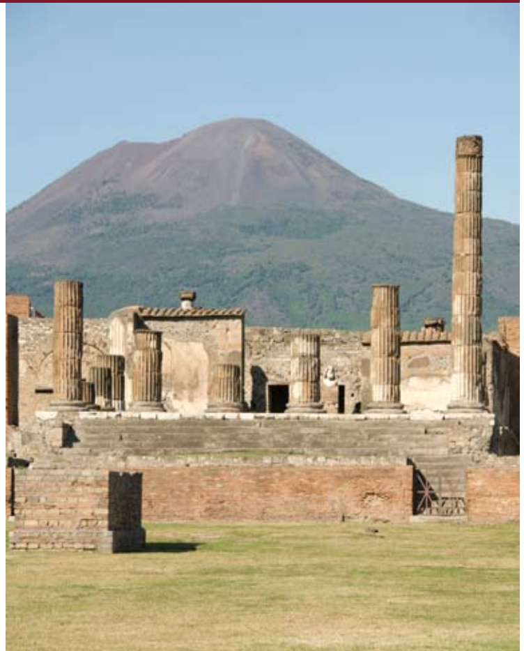
Pompeii and Mt. Vesuvius

The cost of this itinerary, per person, double occupancy is: