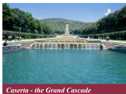
Caserta - the Grand Cascade

Tuesday, October 4. This relaxing day features a drive along the breath-taking Amalfi Coast and a visit to Positano, where square, white houses and luxuriant gardens descend in steep steps to the sea. It became popular as a resort when the Allies arrived in 1943 to establish a rehabilitation center here. Later targeted by the jet-set, it is one of the most popular resort areas on the coast, although the local fashion industry has surpassed tourism as the prime source of income. Why not take home a pezze di Positano , the colorful, ingenious, yet simple designs, as a memento of your adventure on the Sorrentine Peninsula. We’ll also visit a nearby ceramics workshop before returning to Sorrento for a festive farewell dinner. (B, D) Overnight: Sorrento