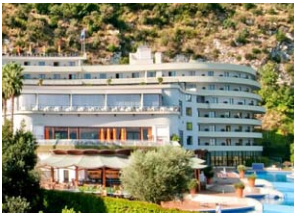
The Sorrento Palace Hotel