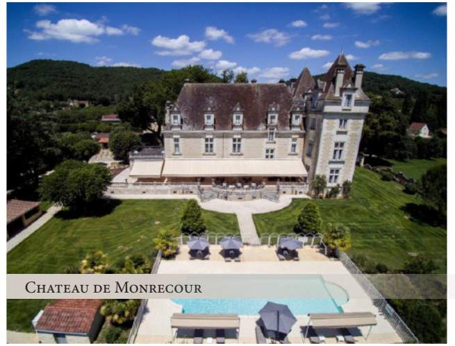
CHATEAU DE MONRECOUR

Key to included meals: B - breakfast, L - lunch, D - dinner