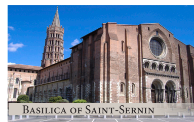
BASILICA OF SAINT-SERNIN

FRIDAY, OCTOBER 5 TH - Morning transfers to Toulouse Airport for return flights to the USA. (B)