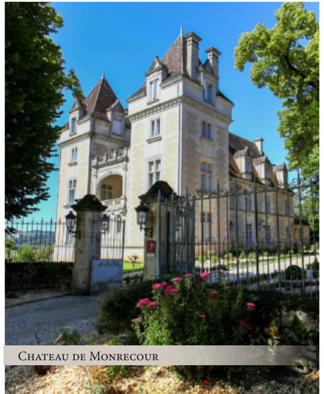
CHATEAU DE MONRECOUR