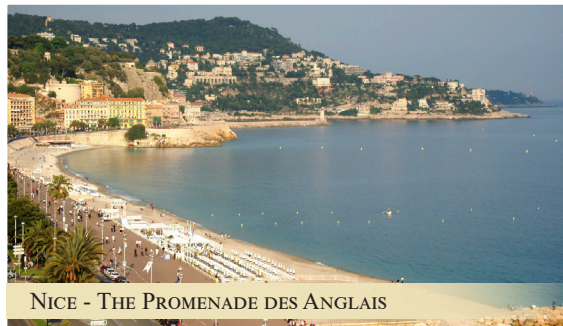
NICE - THE PROMENADE DES ANGLAIS