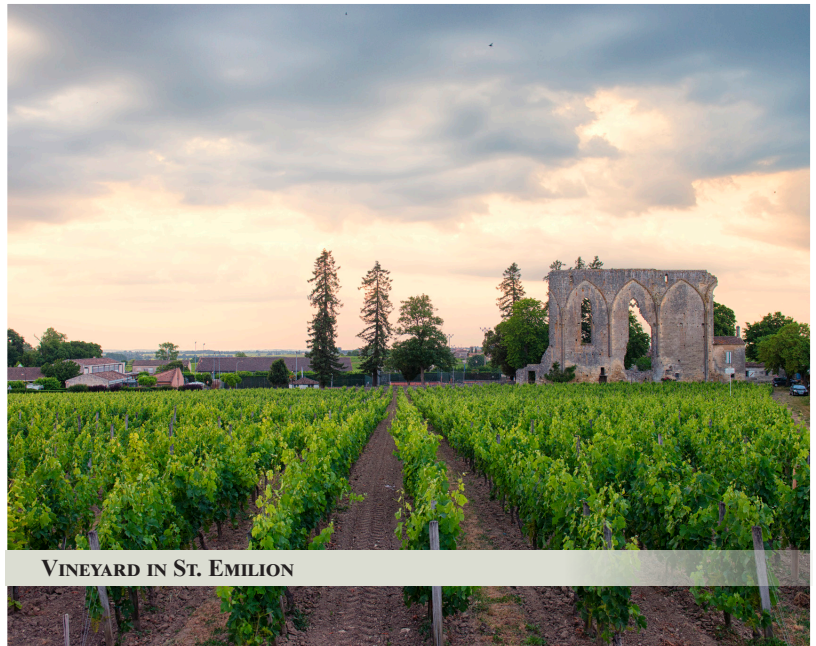
VINEYARD IN ST. EMILION

Bordeaux; the name itself conjures up a myriad of complex wine expectations. As France's largest wine producing region, and home to famous appellations, the region of Bordeaux has much to offer both the wine connoisseur and the novice alike. The city of Bordeaux, once nicknamed La Belle Endormie, or the Sleeping Beauty, used to be plagued with industrial soot and despair, leaving wine lovers wanting to sample the local produce from far away! But like the grapes in the bottles, age has worked in her favor. Over the past decades, the city of Bordeaux has reinvented herself, now mirroring the beauty of the sprawling vineyards that surround her.