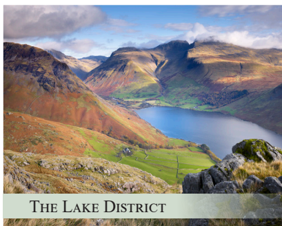
THE LAKE DISTRICT