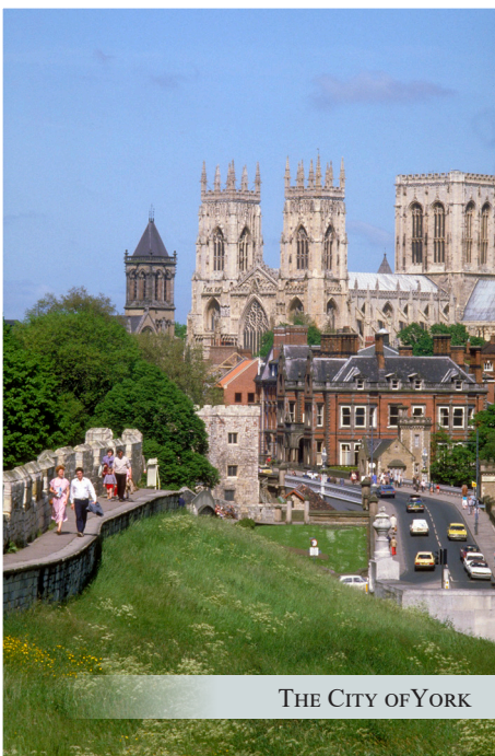
THE CITY OF YORK

TUESDAY, OCTOBER 8 TH - After a leisurely start this morning, we drive to nearby Lindisfarne, also called Holy Island, the home of the religious community established by St. Cuthbert. Durham Cathedral was founded by monks from the Abbey at Lindisfarne. We have to time our visit around the incoming tides, as the island causeway is cut off from the mainland at high tide. Later this afternoon we return to our hotel for a free evening. (B) OVERNIGHT: ALNWICK