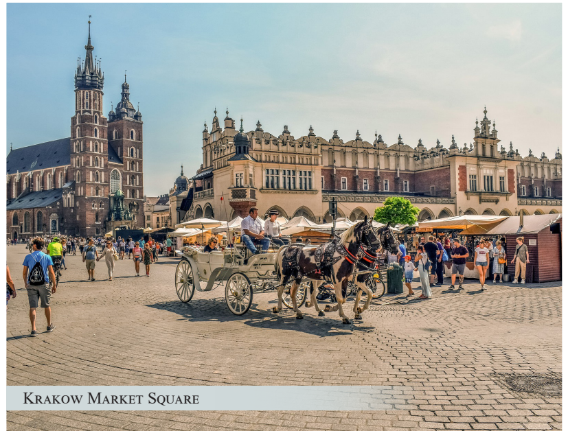
KRAKOW MARKET SQUARE