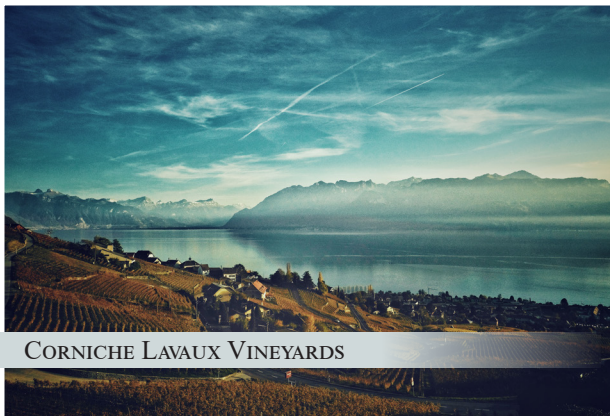
CORNICHE LAVAUX VINEYARDS