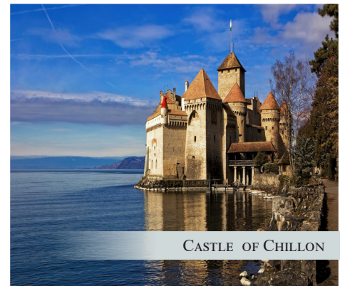
CASTLE OF CHILLON

TUESDAY, OCTOBER 9 TH - This morning we drive the beautiful Corniche de Lavaux, along the lake and past terraced vineyards tumbling down the hillsides, to the town of Vevey. Here, we board a boat for a short cruise to the Castle of Chillon, for a private guided tour. We return to our hotel for a free afternoon. Perhaps take advantage of spa treatments offered here. The evening is also free. (B) OVERNIGHT: OUCHY