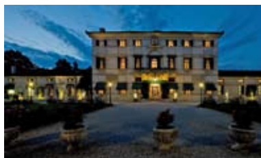
The Hotel Villa Condulmer

Saturday, October 16 th . A free day in the Veneto. From the Villa Condulmer you can take a short train ride into Venice for the day, or to the ancient walled town of Treviso, just to the north. Alternatively you can just relax and enjoy the villa's amenities (golf, horseback riding, etc.). (B) Overnight: Mogliano Veneto