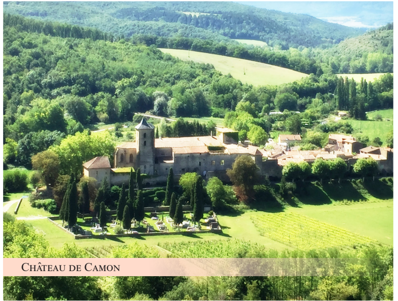
CHÂTEAU DE CAMON