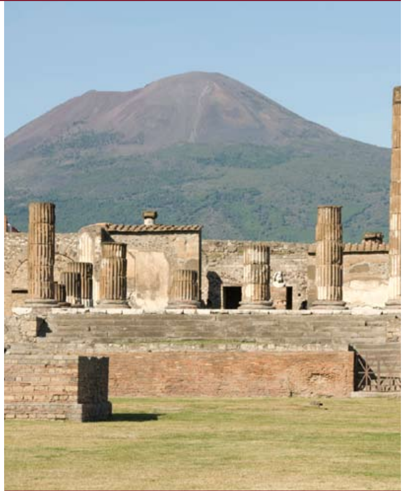
Mt Vesuvius Looms over Pompeii

Why not join us and see for yourself who turns up to greet us for Who Goes There? While you hardly need to be a Doctor Who fan to enjoy this exciting adventure, for those who've been accompanying the Doctor to exotic worlds, Who Goes There? promises to be an especially unique trip of a lifetime!