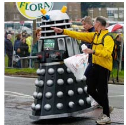
I think he's in that Police Box....

Saturday, October 29. Morning transfers to the airport for return flights to the USA. (B)