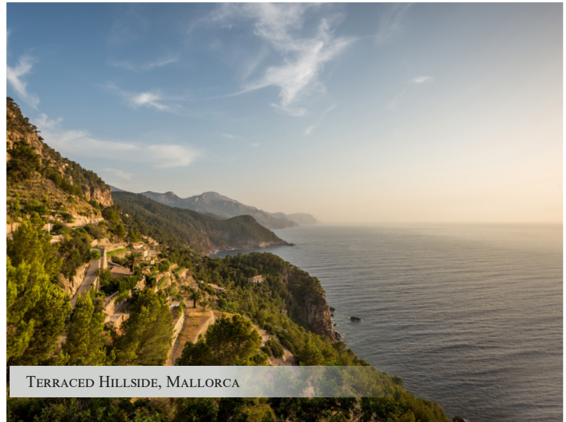
TERRACED HILLSIDE, MALLORCA