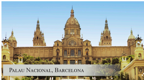
PALAU NACIONAL, BARCELONA

THE COST OF THIS ITINERARY, PER PERSON, DOUBLE OCCUPANCY IS: