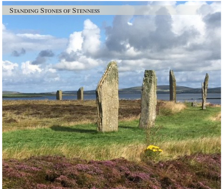
STANDING STONES OF STENNESS