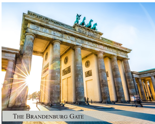
THE BRANDENBURG GATE

THE COST OF THIS ITINERARY, PER PERSON, DOUBLE OCCUPANCY IS: