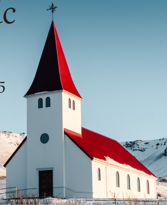
ICONIC RED ROOFED CHURCH