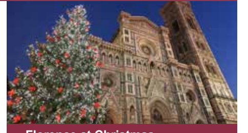
Florence at Christmas

A Mystery Tour?, Nov 8 - 16 $$$ A celebration of the great English Mystery writers & a day trip on the Orient Express complete with a murder mystery lunch.