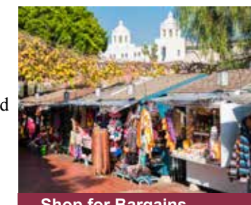
Shop for Bargains

However, currency speculation is NOT our business, so rather than gamble, we try to take a much more conservative approach and we purchase forward contracts in the foreign currencies that we use. These allow us to lock in an exchange rate well in advance and protect us against the violent swings of the markets. This system has allowed us to never have to invoke the clause in our terms and conditions that says we can charge you a foreign currency "surcharge," quite a common practice amongst other tour operators.