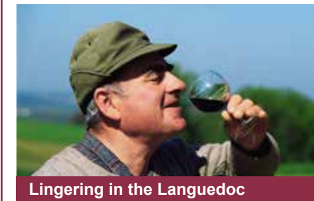
Linger in the Languedoc

Sicily: Island Crossroads, Sept 29 - Oct 9 This ancient island has been home to the many civilizations of the Mediterranean. With an optional extension to the Aeolian Islands.