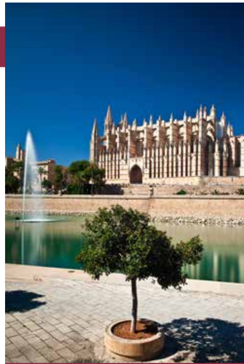
The Cathedral, Palma, Mallorca

2. If your phone is unlocked you can purchase your European SIM card in advance and have it sent to you in the States. This way you would be able to leave the number with people who need it before you go. One place to find these is at www.simsmartprepaid.com though