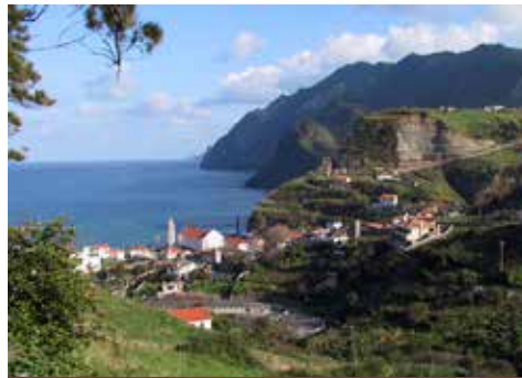
Madeira - the Floating Garden

But of course, it doesn't always work to our advantage. The present exchange rates for the Pound and the Euro are much better than the forward contracts we purchased for this spring! When you protect yourself against an increase you also lose the ability to take advantage of a downturn, but that was only for our spring trips - and even then you, the traveller, will still enjoy the benefits of lower relative prices when you are actually in those countries buying things.