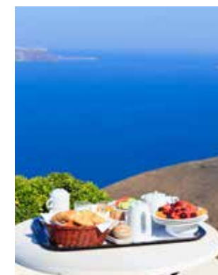
Breakfast is included

This is, of course, a very unfair assessment and I make the point with my tongue firmly in my cheek. There are many factors that affect foreign exchange rates and many other Eurozone countries whose economies are contributing to the decline of the Euro. But so far only Greece is threatening to leave the "single currency," and this is causing a great deal of nervousness in the markets. And nerves, as opposed to facts, are the main driving force behind most financial markets.