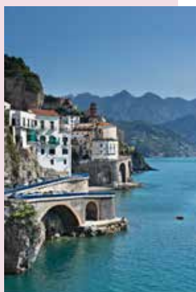
The Amalfi Coast

For more information, contact Discover Europe toll-free at 866-563-7077; contact us via e-mail at discovereurope@earthlink.net ; or visit our web site at www.discovereuropeltd.com .